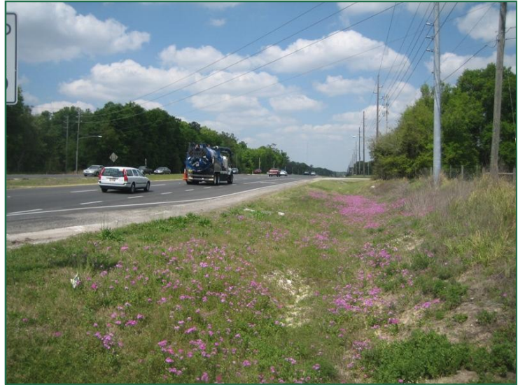
McBride Land & Development, Co.