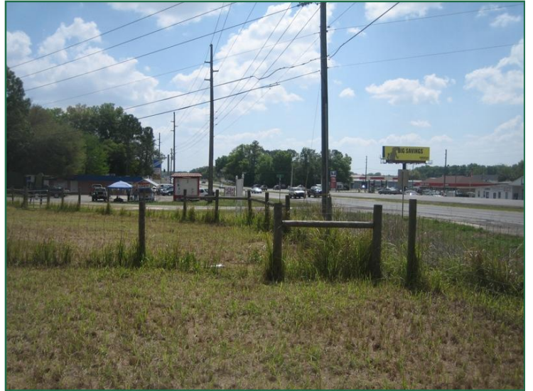
McBride Land & Development, Co.